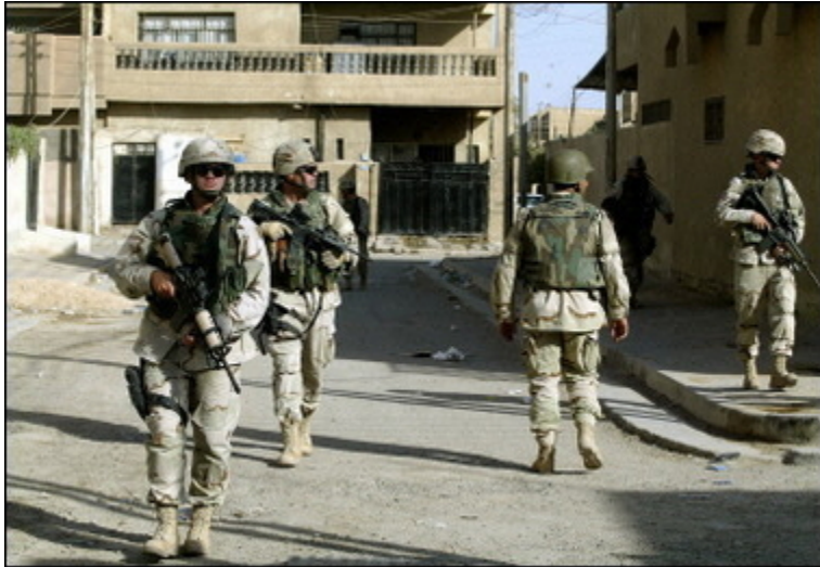
6.14.05 US soldiers patrol in the Al-Ray neighbourhood of south Baghdad.