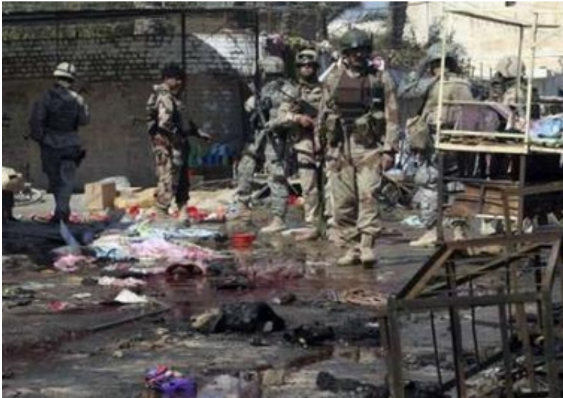
U.S. soldiers at the scene of a bomb attack in Baquba February 23, 2006.