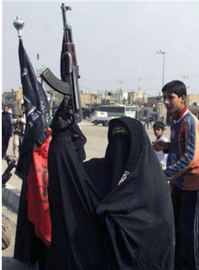
Demonstration against the occupation in Baghdad's Sad'r city February 22, 2006.