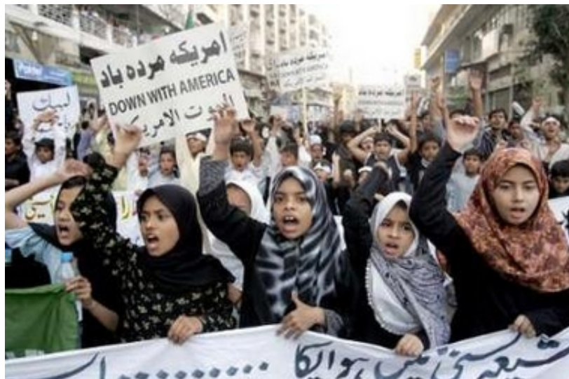
Pakistani Shi'ite Muslims during a rally in Karachi February 23, 2006. Imamia Students Organisation denounced the bombing of the Golden Mosque in Iraq. (THE WRITING ON THE PLACARD READS: DEATH TO AMERICA)