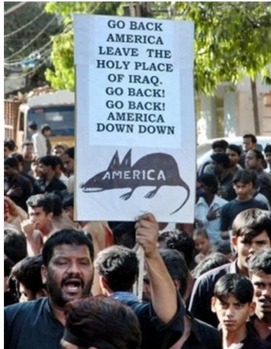
Shiite Muslims in Hyderabad, India during a protest against the bombing of the major Shiite Askariya Shrine in Iraqi Feb. 23, 2006.