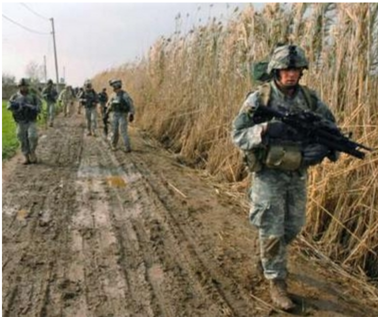
U.S. soldiers from 2nd Battalion, 502nd Infantry Regiment, patrol the village of Shakaria January 20, 2006