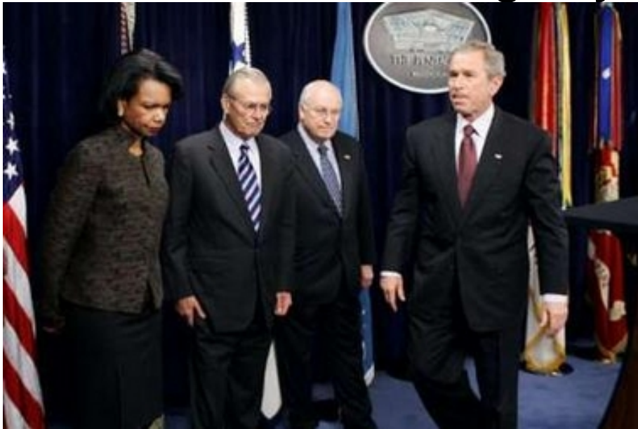
Bush at the Pentagon January 4, 2006.