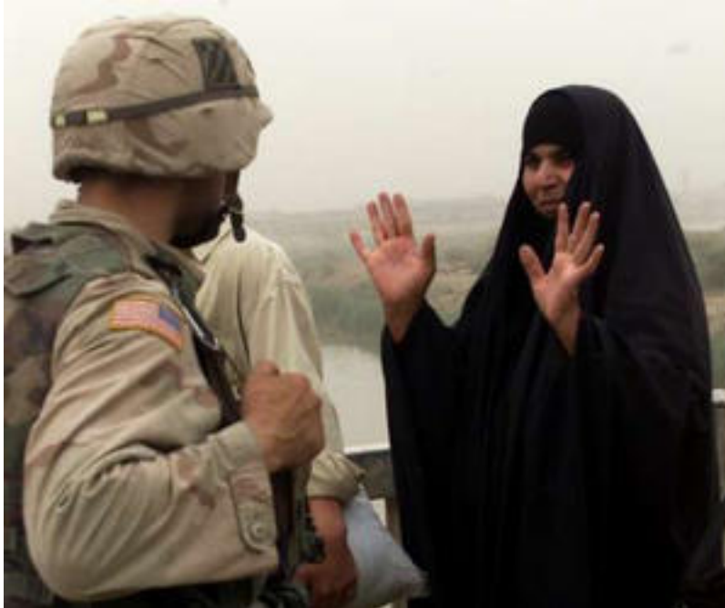
A U.S. Army soldier searches Iraqis at a check point on a highway in Baghdad May 30, 2003.