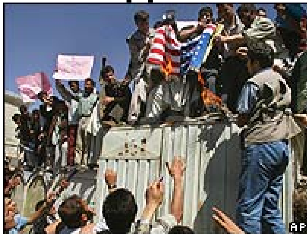
Burning the US flag - protesters vent their frustration.

While US military officials say the Taliban has been severely weakened if not crushed, thanks to US-Afghan military operations to root them out and to the co-opting of some 50 high-ranking Taliban leaders into Karzai's government, recent attacks prove the contrary.