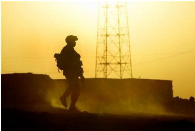
A U.S. Marine patrols near Haditha Aug. 4, 2005.

REALLY BAD PLACE TO BE THEN REALLY BAD PLACE TO BE NOW NO MORE DELAY: BRING THEM ALL HOME TODAY