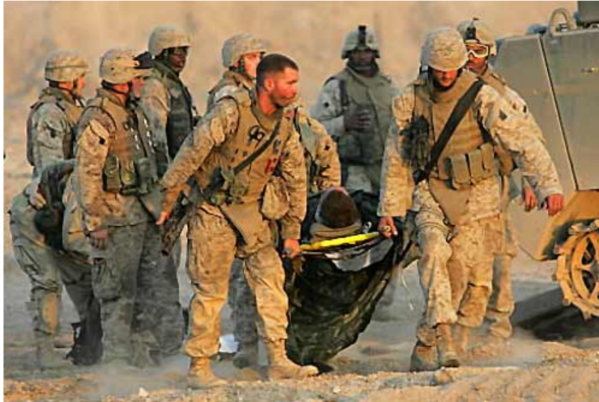
Iraq November 2004: Marines carry wounded after mortar attack.