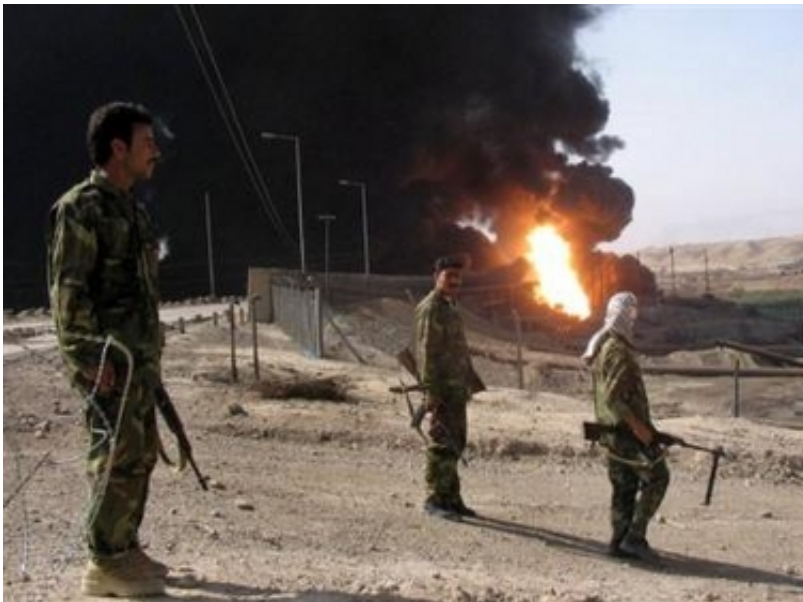
This pipeline transports oil to the port of Ceyhan, Turkey

NOT TODAY IS DOESN'T; AND NOT TOMORROW EITHER