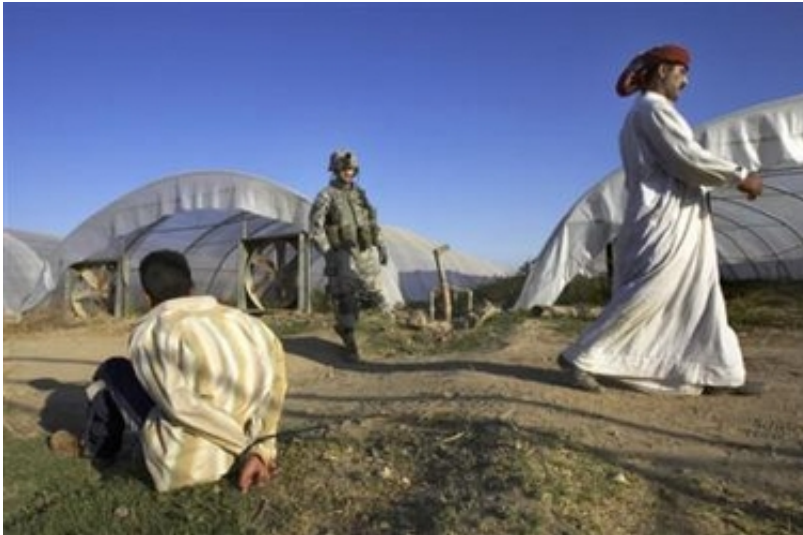
An Iraqi boy sits with his hands bound while U.S. Army soldiers from the 101st Airborne Division question other men near Balad, “Sovereign” Iraq, Nov. 4, 2005.

[Fair is fair. Let’s bring 150,000 Iraqis over here to the USA. They can kill people at checkpoints, bust into their houses with force and violence, overthrow the government, put a new one in office they like better and call it “sovereign” and “detain” anybody who doesn’t like it in some prison without any changes being filed against them, or any trial.]