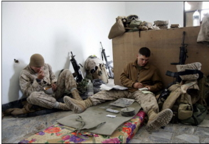
US Marines in an occupied Iraqi building in Zaidon.