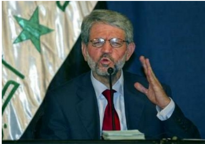
Jabar in Baghdad November 17.

U.S. OCCUPATION RECRUITING DRIVE IN HIGH GEAR;