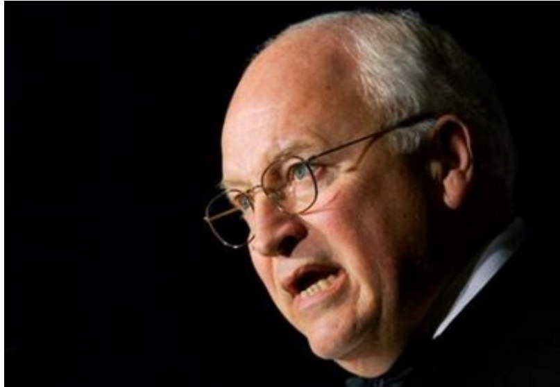
Cheney November 16, 2005.