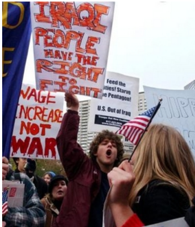
Rally, Oct. 29, 2005 in Boston.

Placing the list safely in the trunk next to the boxes of key chains, stickers and yellow water bottles he gives to potential recruits, he added: "Like in the dating scene. Sometimes no means yes. She just says it to make you want her more, you know?"