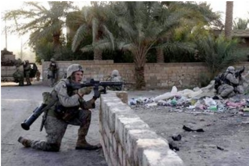
US Marines from 3 rd Platoon, Company K, 3 rd Battalion, 1 st Marine Regiment in the town of Haditha.

LETHAL ENVIRONMENT: NO MISSION: BRING THEM ALL HOME NOW