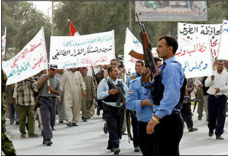
Iraqi police demonstrate in Mosul.