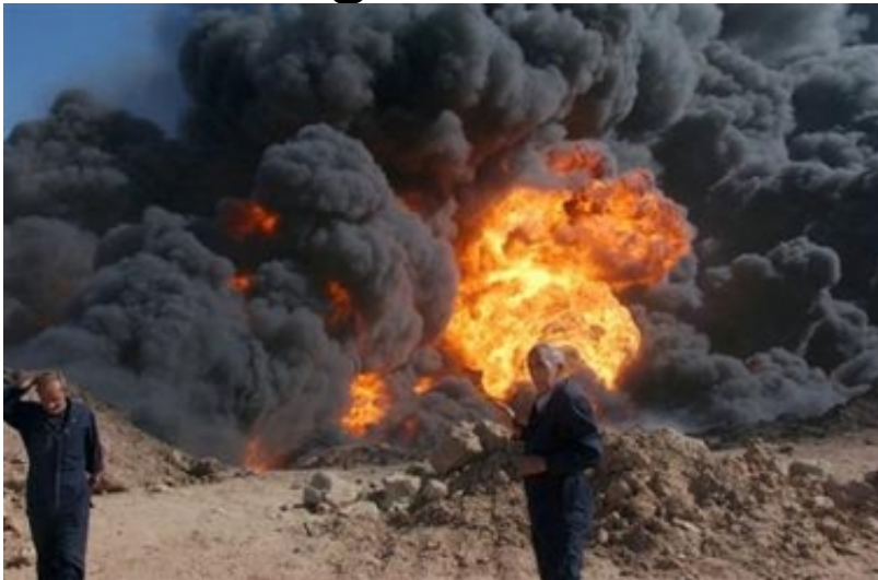
Burning oil pipeline in the Kirkuk area, Oct. 20, 2005. Insurgents using explosives set fire to the main oil pipeline in northern Iraq. The pipeline links an oil field in the northern city of Kirkuk to Iraq's largest oil refinery in Beiji.