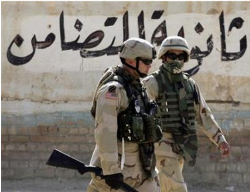
U.S. army soldiers walk during a patrol near Baquba, Iraq October 14, 2005.