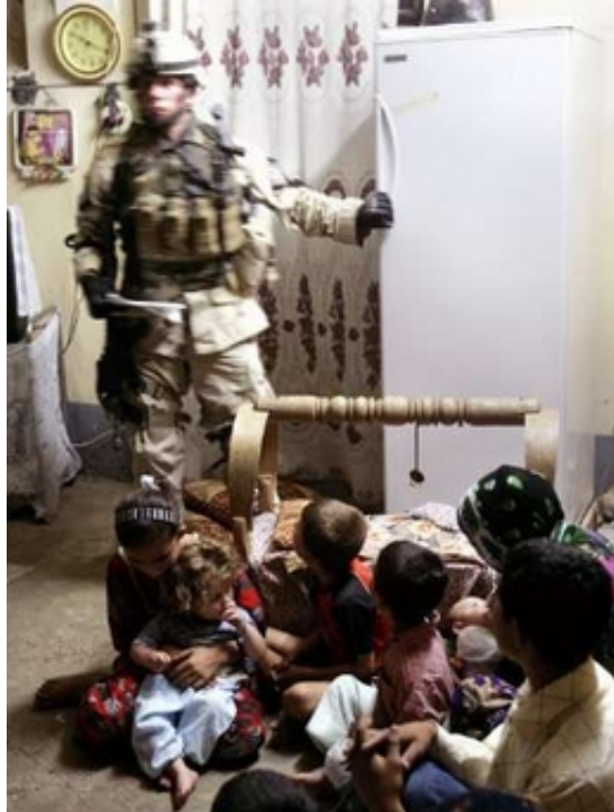
A U.S. soldier from the Stryker brigade inspects the interior of a refrigerator in front of an Iraqi family during a night raid in Mosul in northern Iraq July 25, 2005.

[There's nothing quite like invading somebody else's country, busting into their house by force at night bearing lethal weapons, humiliating the parents in front of their scared kids, and even, get this, poking around in their refrigerator.