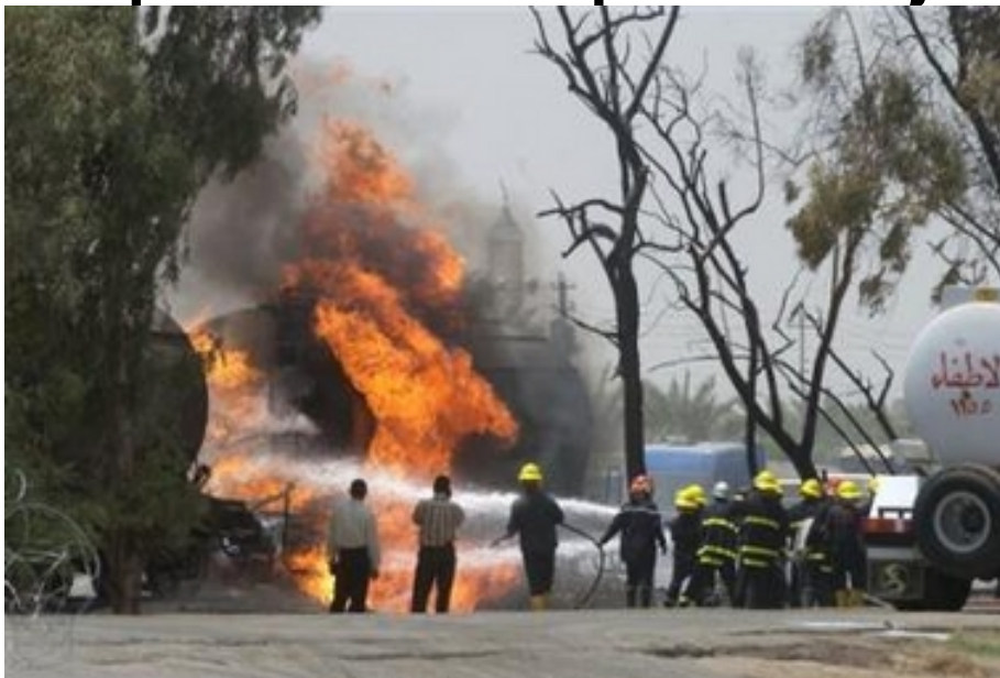
Iraqi firefighters fight flames of an exploded fuel tanker train carriage, July 28, 2005, in the Dora area of Baghdad, Iraq.