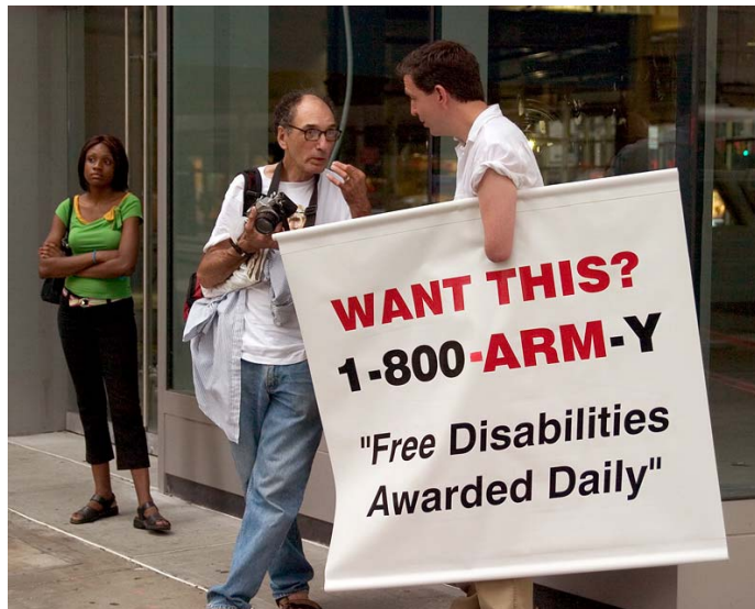
PAYING THE PRICE