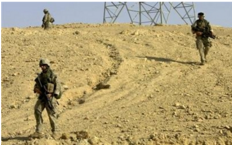
U.S. Army soldiers search for explosive devices on the side of a road in Baghdad August 5, 2005.