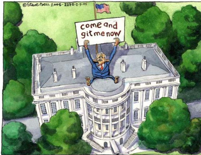
© Steve Bell 2005 [Thanks to NB, who sent this in.]

From: Rose Gentle To: GI Special Sent: September 03, 2005 1:21 AM Subject: how will bush, help