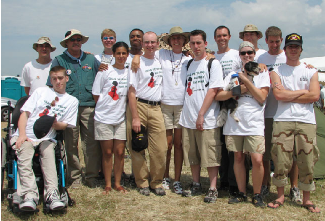
Cindy Sheehan and Iraq Veterans Against The War ( www.ivaw.net )