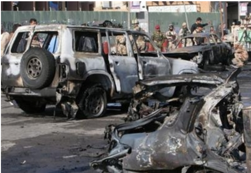
A police vehicle destroyed at the site of a car bomb explosion in Baghdad Dec. 26, 2005.

December 26, 2005 By JASON STRAZIUSO, Associated Press Writer & The Canadian Press & MNF Release A051226a & Reuters