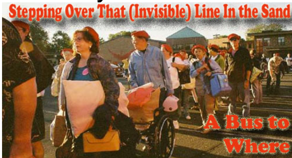
St. Joan of Arc Catholic Church graphic