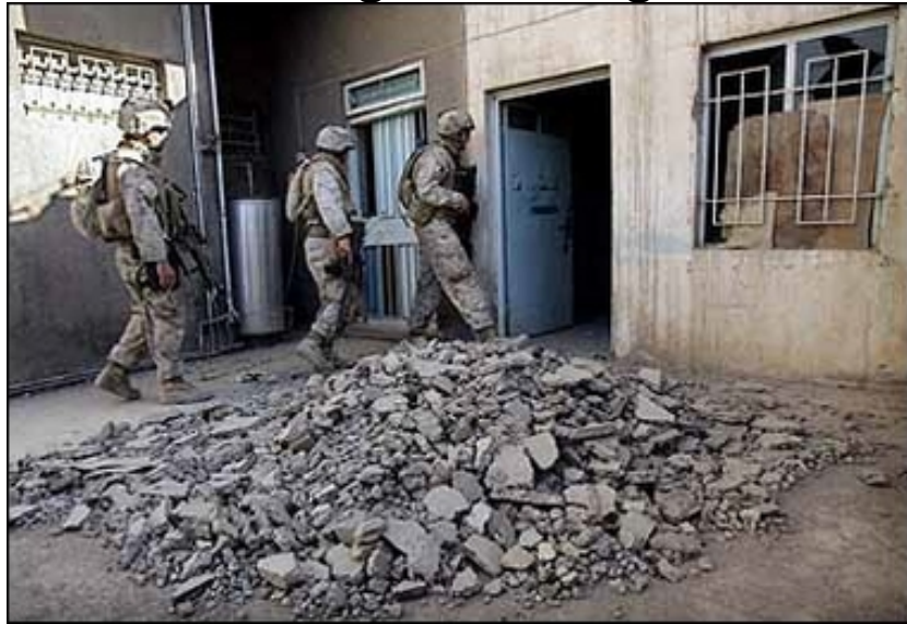
11.12.05 US Marines from Echo Company 2nd Battalion 7th Marine Regiment, search a building during a foot patrol through the city of Fallujah.